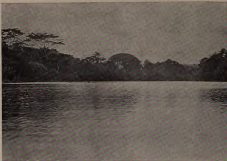
The lower reaches of the Chagres